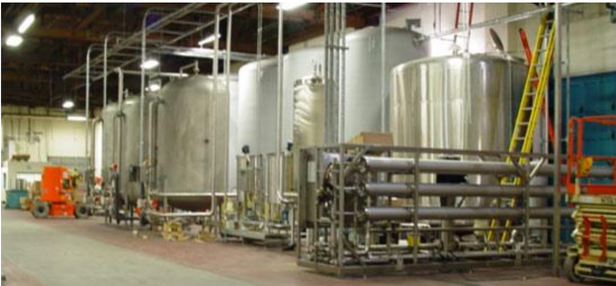
Figure 1: Water Treatment in the Beverage Industry

Beverages and Soft drinks water treatment system components detailed explanation (See figure 2):