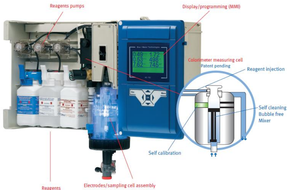
Figure 3: Analyzer schematics